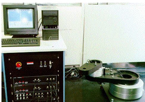
(c) DSP-based DD Manipulator Control System