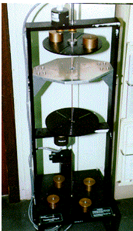
(a) 3-Mass Torsional System