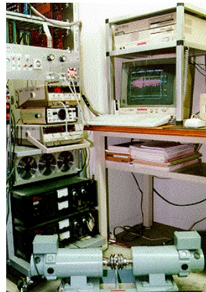
(b) M-G Set for Motor Control Experiment