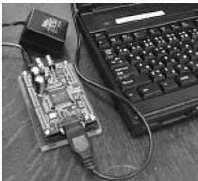
Fig.1 C50 DSP Starter Kit connected to IBM Think Pad by RS232C Cable

We changed this lecture to Lecture + Exercise. Using 20 TMS320C50 DSP Starter Kits which Texas Instruments Co. (TI) gave us in the University Program and 20 host computers presented from IBM, we started. Program of DSP is developed in PC and downloaded into DSP via RS232C line. After simple numerical calculations, real time signal processing via AD/DA converters is given as the subject.